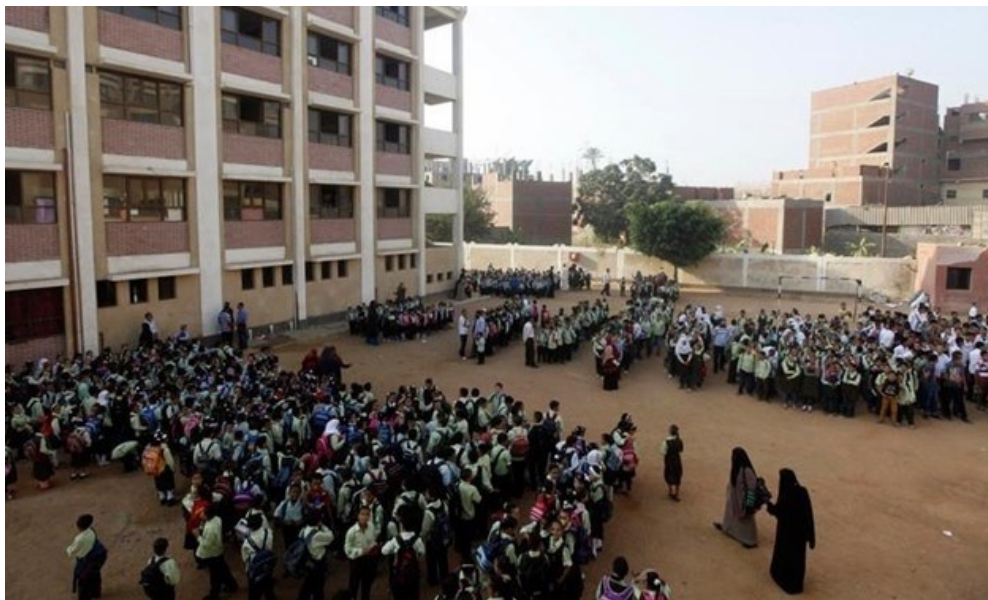
Students line up on the first day of their new school year at a government school in Giza

"Shadow education" — extracurricular classes that reinforce existing school curricula — is extremely popular among urban, middle-class Chinese parents. Last year, the after-school tutoring market for primary and secondary school students was worth 624 billion yuan ($93.2 billion), according to an influential industry report. And most companies are targeting one consumer group: moms. To read more, click here .