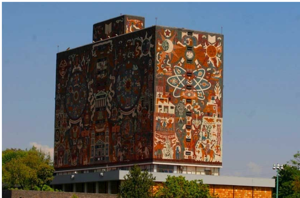
Autonomous University of Mexico

Interested in studying abroad in Italy? We found a complete guide to the lingo, culture and making friends. To read more, click here