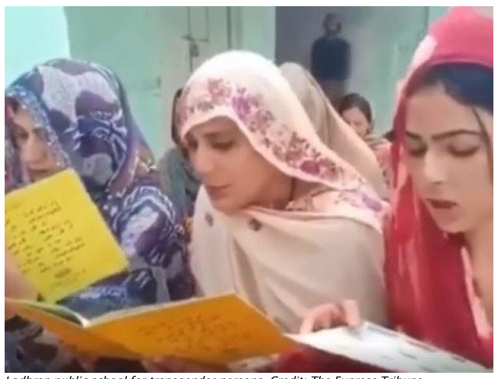
Lodhran public school for transgender persons.

The Nigerian government plans to shut down and demolish 68 institutions it considers to be operating illegally without accreditation. To read more, click here.