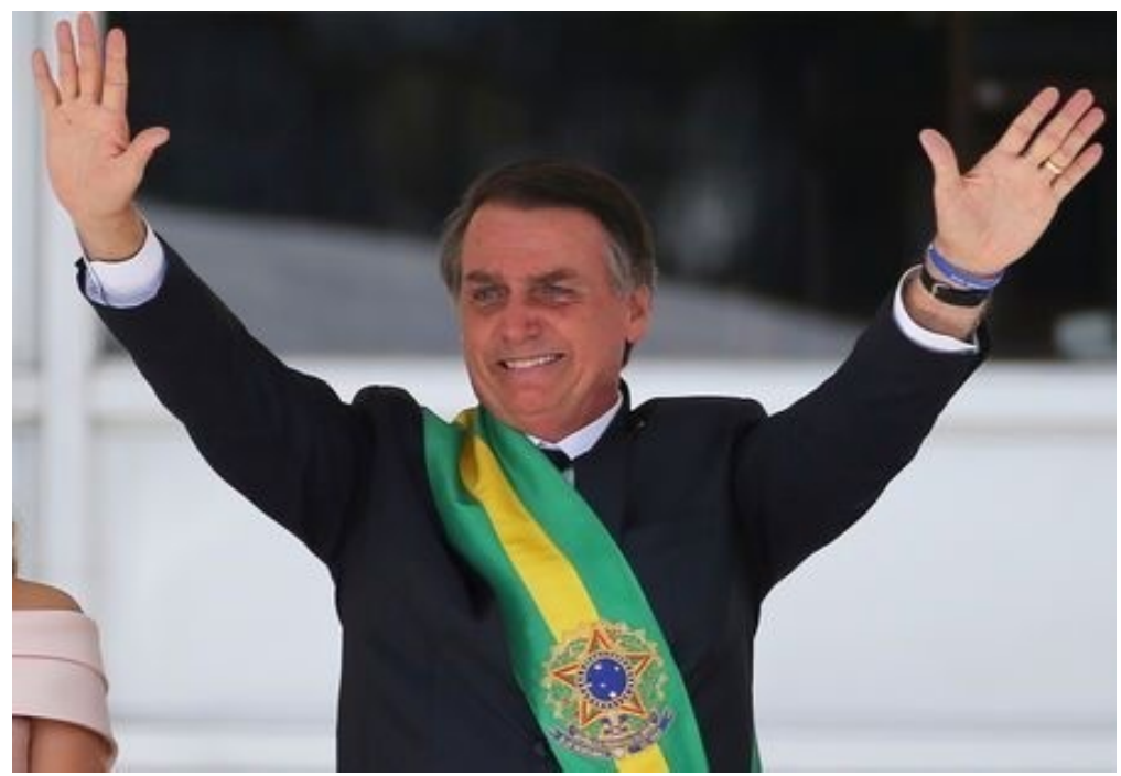
Brazil's new President Jair Bolsonaro.