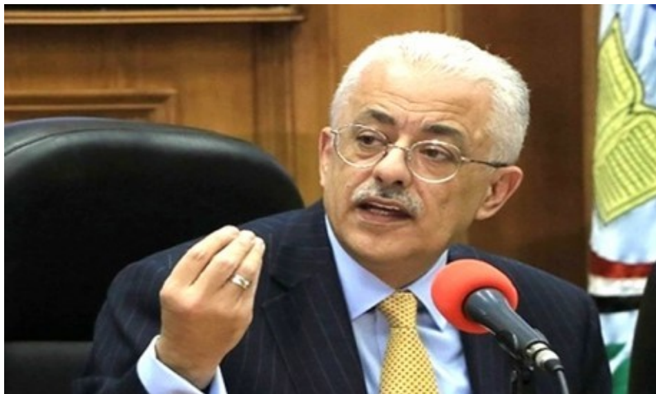
Egypt's Education minister Tarek Shawki

With 97% of Latin American kids out of class, some criminal groups see a bonanza in recruitment. To read more, click here .