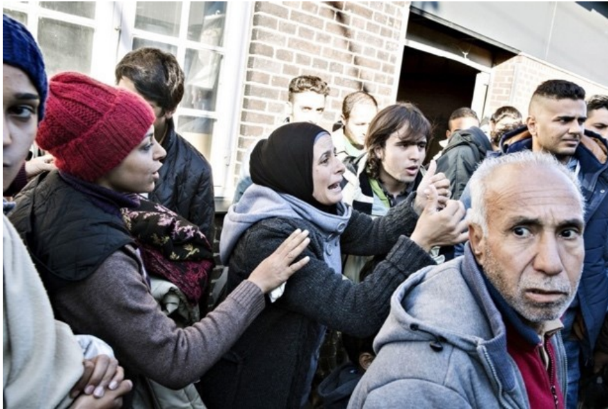
Migrants at Denmark's Padborg Station, after crossing over the border from Germany

New research from University College London, Australia is overtaking the UK as the world's second biggest destination for international students. To read more, click here .