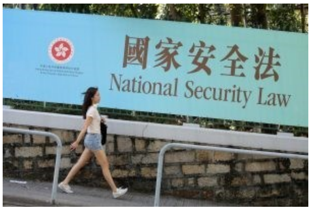
A promotional banner of the national security law for Hong Kong, in Hong Kong, Tuesday, June 30, 2020.

France offers a pathway, via a lottery, to the Maitrise program in Elementary Education to a parent of three children. To read more, click here.