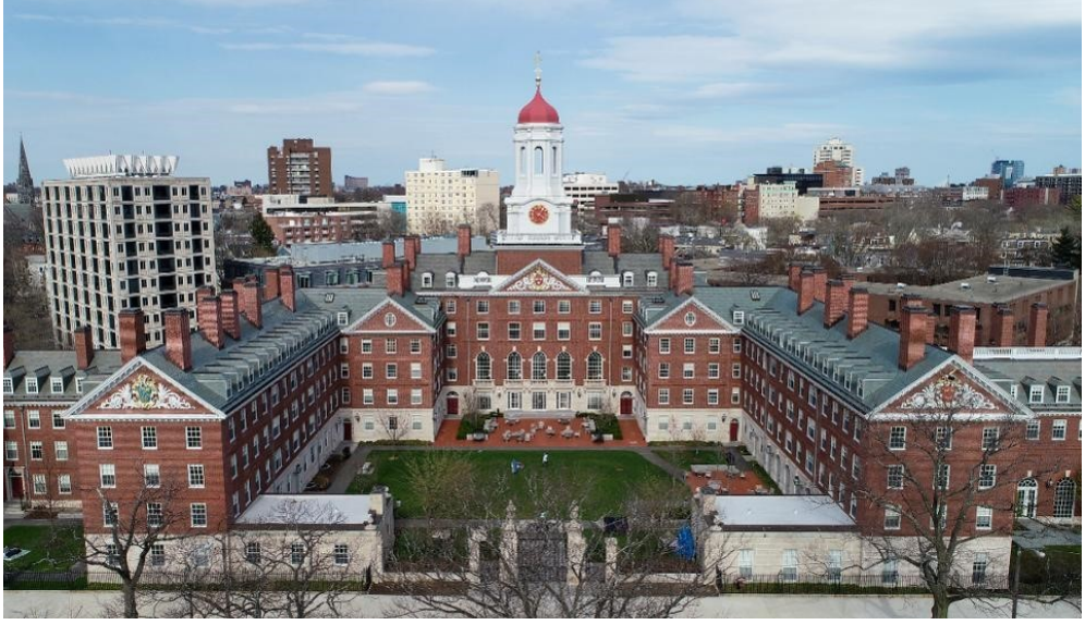
Harvard University's Dunster House in Cambridge, MA, on April 11, 2020.