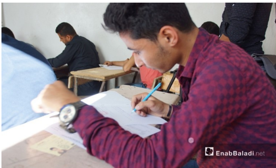
High school and middle school examinations at the schools of the Free Hama Directorate, rural Hama - June 19, 2018

Students at all Russian universities are to be allowed the option of presenting a start-up that they have launched instead of submitting a traditional masters thesis, the Russian Ministry of Science and Higher Education has announced. To read more, click here