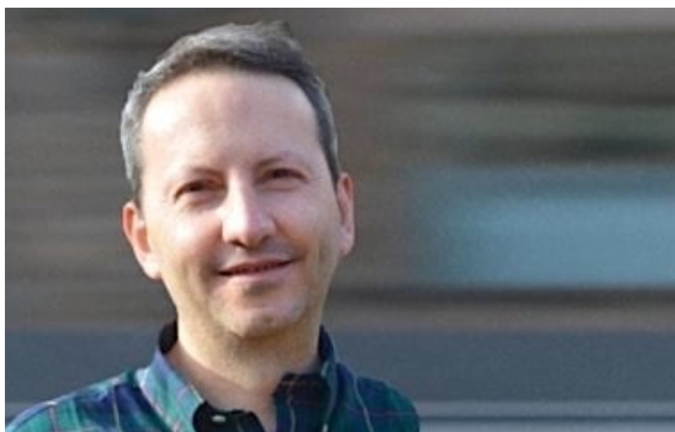
Dr. Ahmadreza Djalali, sentenced to death

The government of Ghana wants to include the promotion of the learning of the French language in basic schools and across all other levels of learning, as part of a general reform of Ghana's education sector. To read more, click here