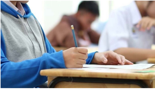
Students in class (Education)