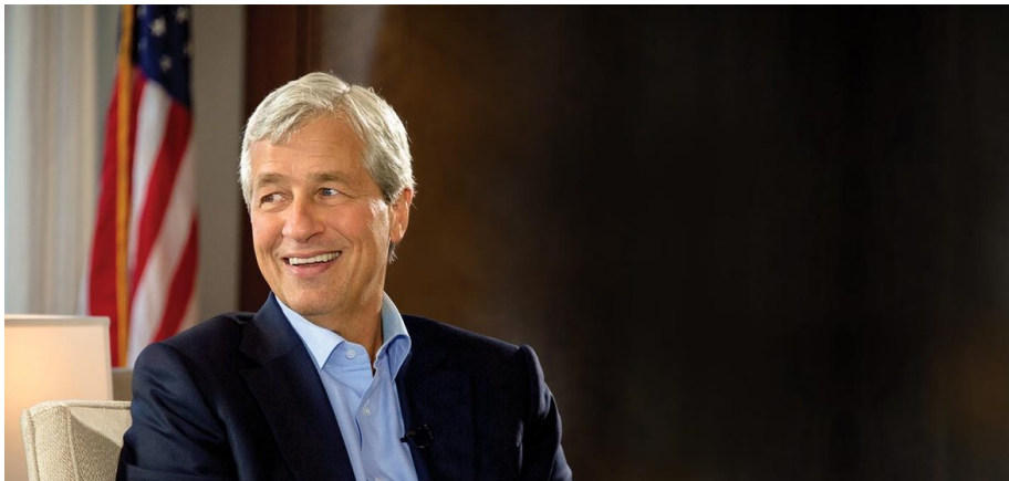
Jamie Dimon of JPMorgan

First launched in 2017, Arizona State University's "Education for Humanity" spans across multiple countries and seeks to provide education to displaced learners. The program offers online classes from topics on learning to teacher training, and is most often utilized by students ages 18 to 35. To read more, click here