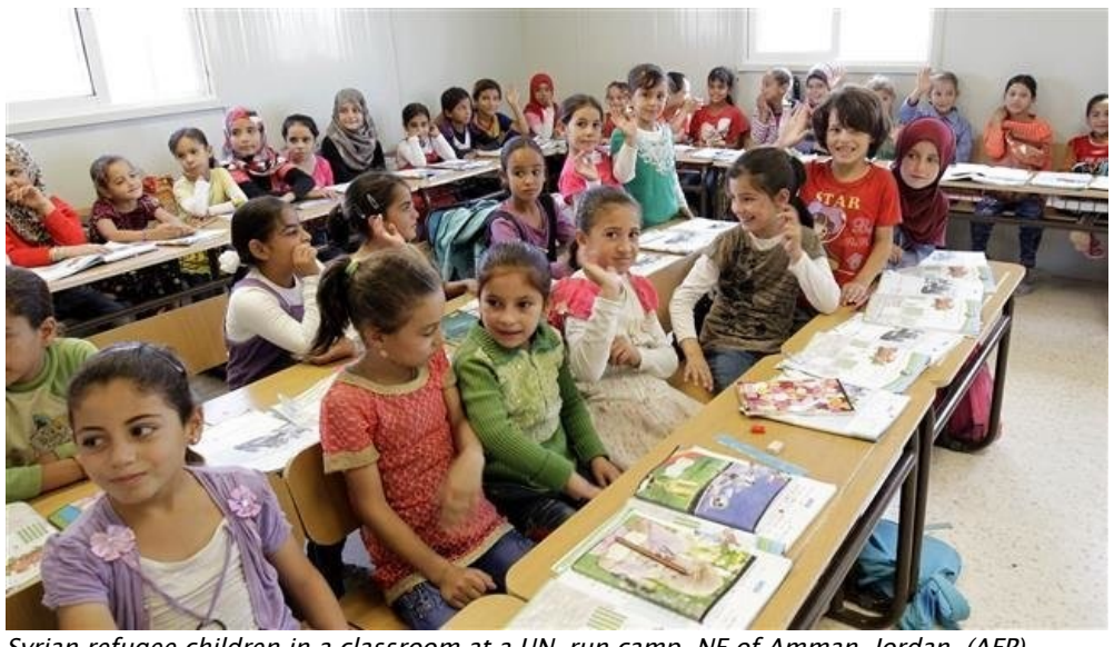
Syrian refugee children in a classroom at a UN-run camp, NE of Amman, Jordan.