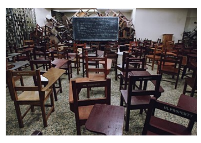
University of Liberia, Monrovia, Liberia