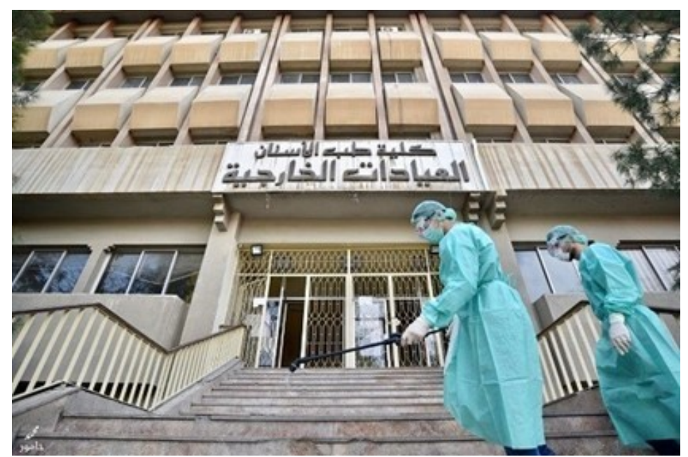
Workers disinfect the steps of a building at Damascus University.

South Korea will allow online joint degree programs among universities at home and abroad beginning next year. To read more, click here.